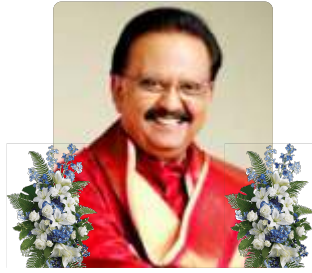
Padma Bhushan Shri S. P. Balasubrahmanyamji (1946-2020)

Shradhanjali from the entire Community of Singers of India to our Beloved