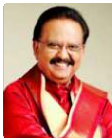
S P BALASUBRAHMANYAM