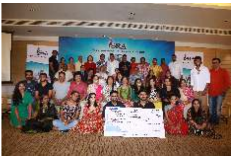
SPB Sir at the 1st Royalty Distribution of ISRA in Chennai on 13-4-2018